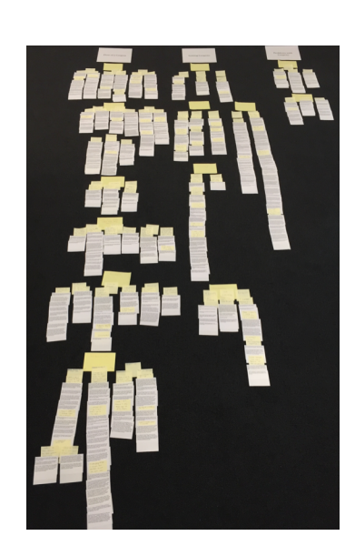
Figure 1: Results of our affinity analysis with 459 direct quotes serving as the leaf notes in the diagram.

via email in the past two weeks and 65% had actually redeemed one. To explore this topic in greater depth, we conducted an online survey dedicated to couponing in July 2016. We aimed to quantitatively size recent interactions with coupon emails, such as the last time they were used, shared, saved for later or unsubscribed from. This MTurk survey included questions about how people organized their email related to coupons and deals. The survey comprised 151 participants from diverse backgrounds. They ranged between 19 and 67 years old, 47% were female, worked a variety of occupations, and lived in 36 different states. We paid them $1.50, reflecting an average hourly rate of $12.