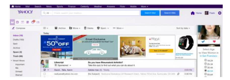
Figure 3: A ranked coupon feed that shows the most relevant deals from email.

deals later and have a designated, visible, and easily accessible place for saved coupons. While Google's Promotions tab is a first step towards a feed of deal emails, it is still a reverse chronological list of all coupons, making it difficult to find ones that a user is most likely to engage with, which adds to the feeling of email overload.